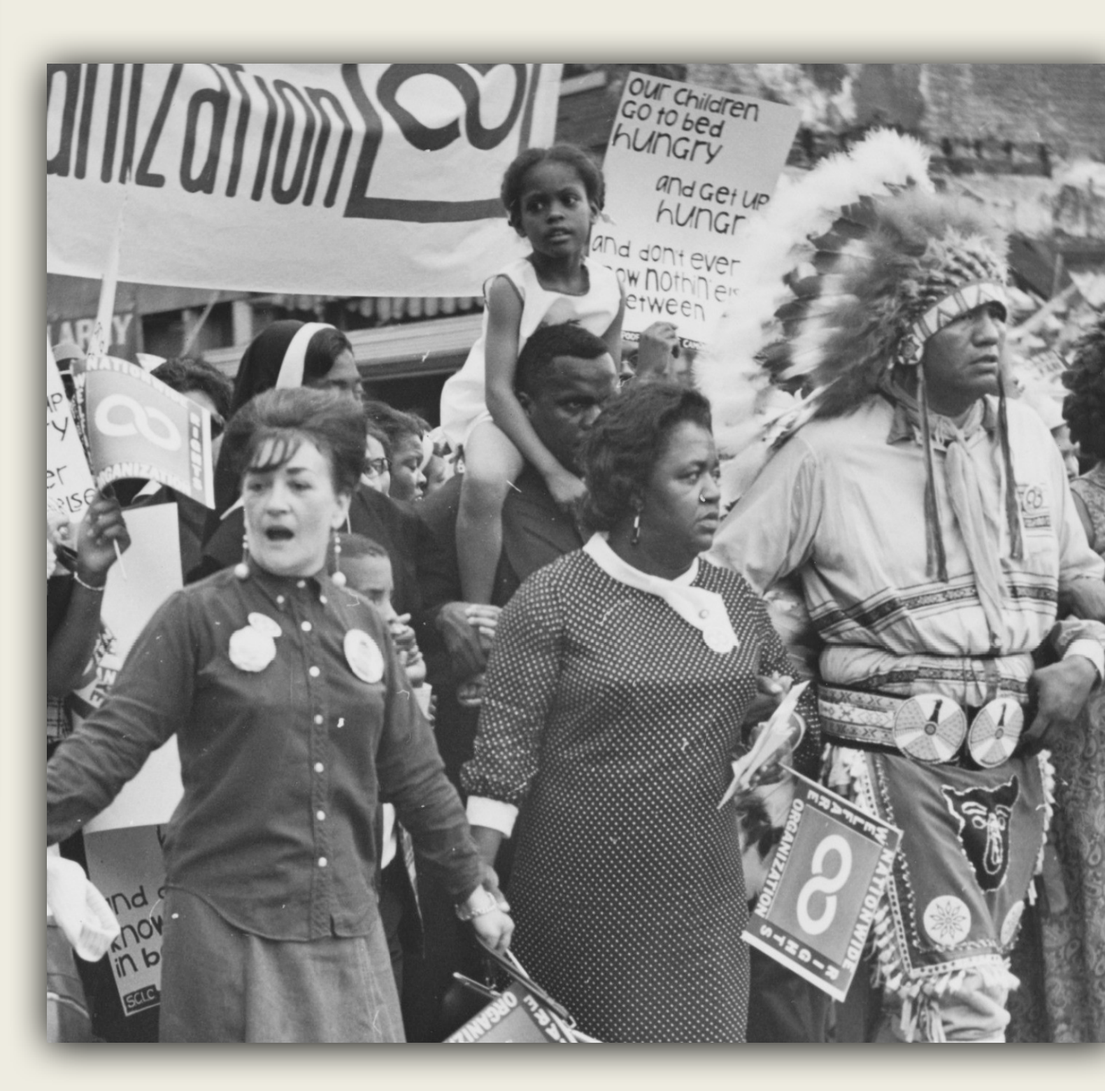
1968 POOR PEOPLE'S CAMPAIGN