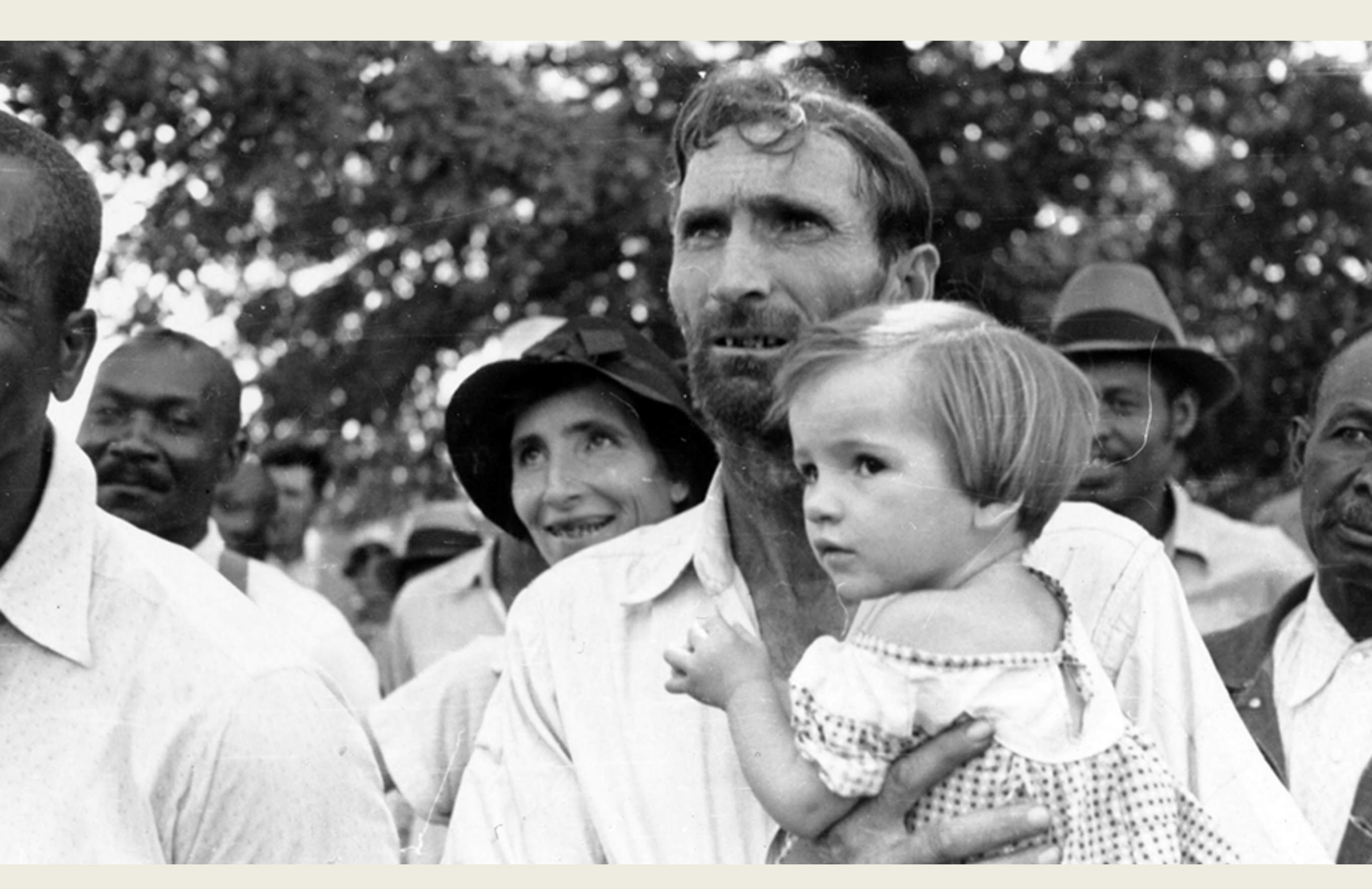
1937 SOUTHERN TENANT FARMERS UNION MEETING IN ARKANSAS