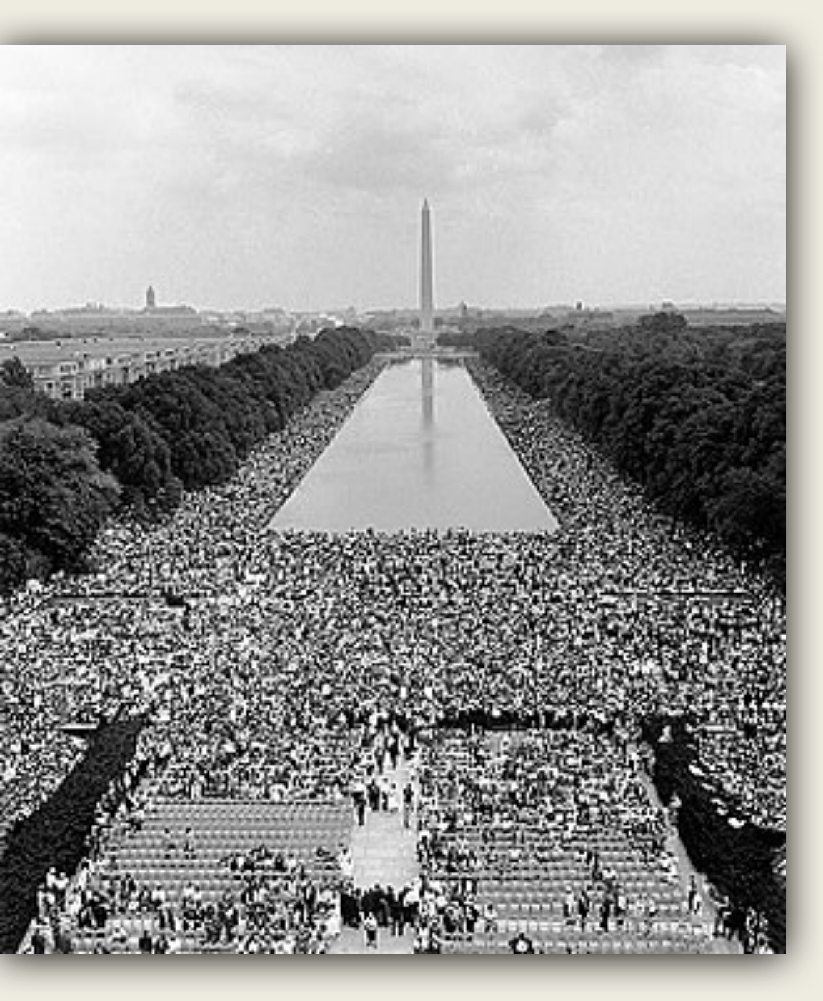
1963 MARCH ON WASHINGTON FOR JOBS AND FREEDOM