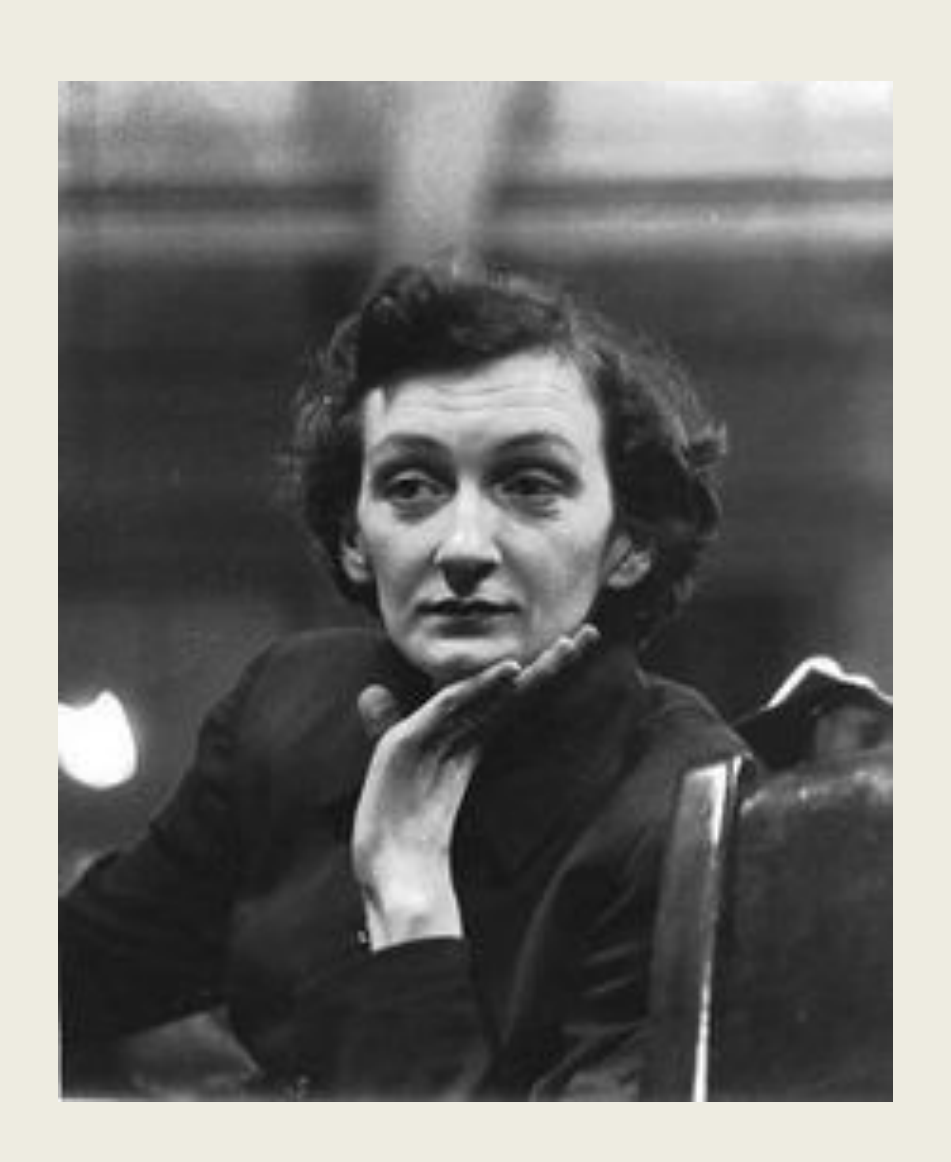
"The Other America"