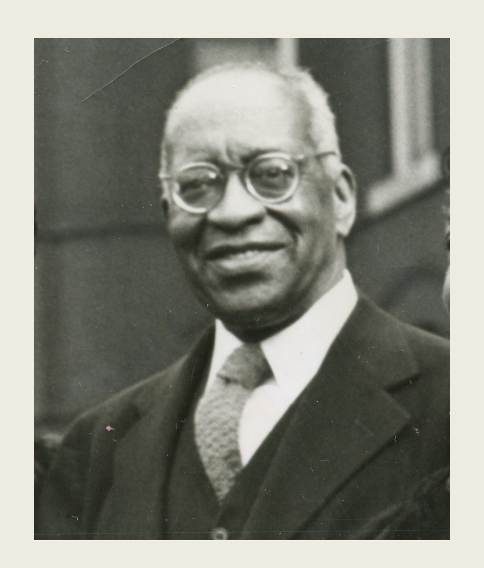
"The Other America"